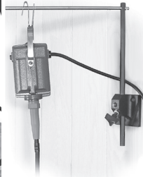
Wall Mount set-up with MAMH-2 using the MABC-2 Base attaches to wall for hanging one motor