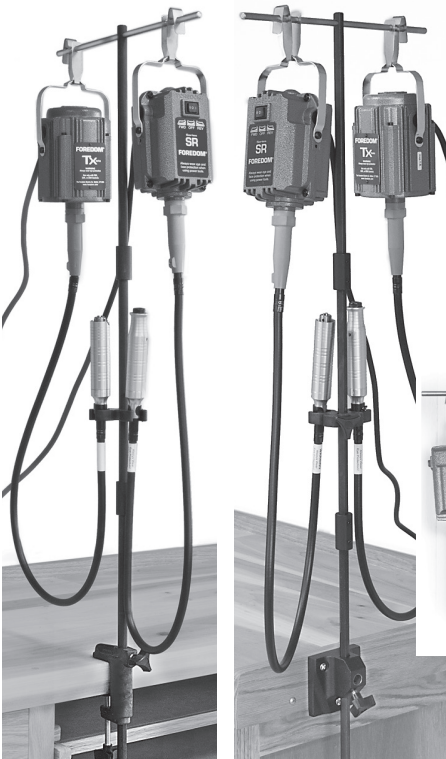
MAMH-1 with MABC-1 Clamp attaches to bench